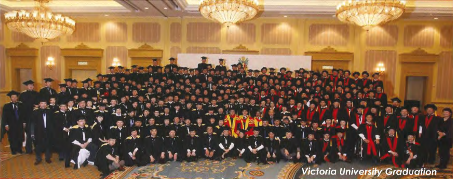
Victoria University Graduation